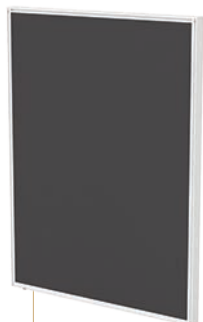
Cubit 50 No Duct Panel (Full Solid)