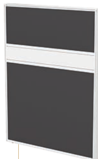
Cubit 50 Above Desk Mid Duct (Full Solid)