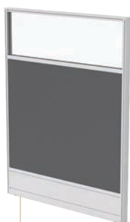
Cubit 50 Base Duct Panel (Half Glass)