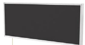
Cubit 50 No Duct Desk Mounted